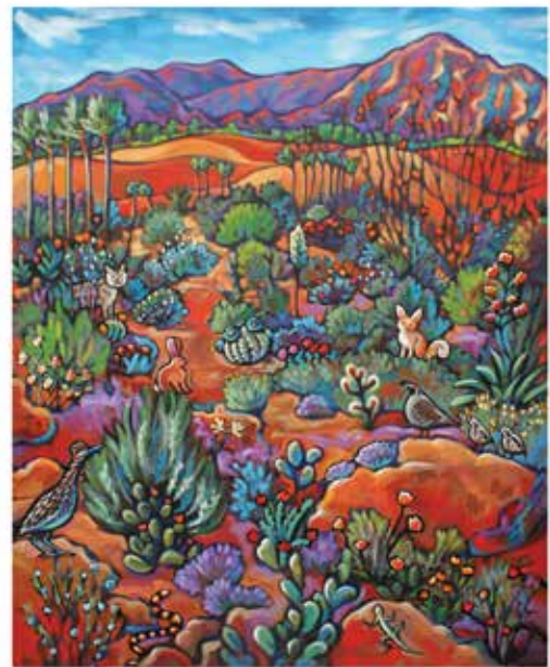
INDIAN WELLS ARTS FESTIVAL APRIL 1, 2 + 3, 2016 AT THE TENNIS GARDEN, INDIAN WELLS, CALIFORNIA

In addition to art, wine, food, live entertainment and interactive children's activities, the Indian Wells Arts Festival features its popular "Eggs + Champagne in the Garden" brunch from 10 a.m. to 12 p.m. on Saturday and Sunday. For complete details on the Indian Wells Arts Festival, visit www.indianwellsartsfestival.com .