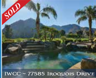
IWCC ~ 77585 IROQUOIS DRIVE

4 BED+ OFFICE, 4.5 BATH $2,100,000 FURN.