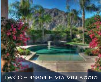
IWCC ~ 45854 E. VIA VILLAGGIO

VOTED BEST OF VALLEY TOP 5 FOR 2014! LEADERS IN MARKETING AND SALES OF LUXURY HOMES WITH 20+ YEARS OF PROVEN SUCCESS IN INDIAN WELLS!