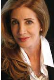
REALTOR® BRE#: 01457476