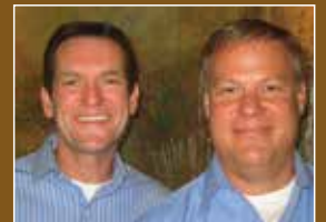
Cal BRE# 01806017/01805986