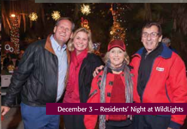
December 3 - Residents' Night at WildLights