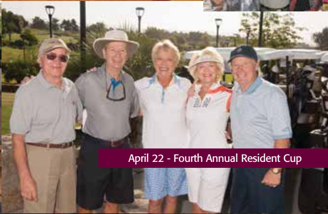
April 22 - Fourth Annual Resident Cup