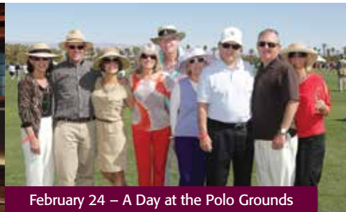
February 24 - A Day at the Polo Grounds