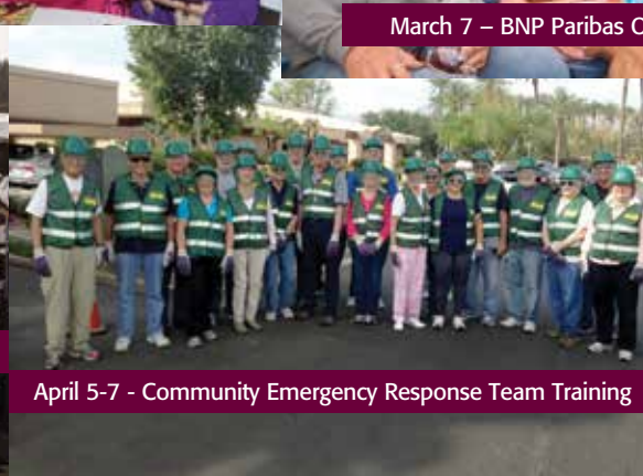
April 5-7 - Community Emergency Response Team Training