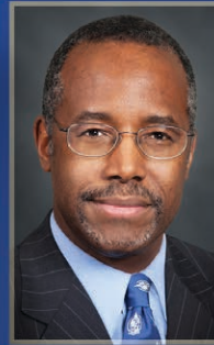
BENJAMIN CARSON, M.D.