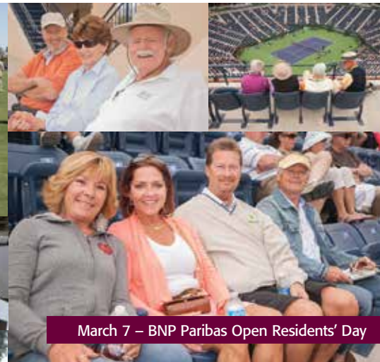
March 7 - BNP Paribas Open Residents' Day