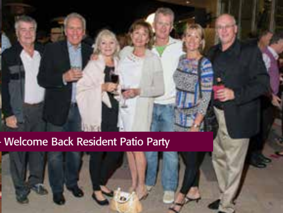
November 5 - Welcome Back Resident Patio Party