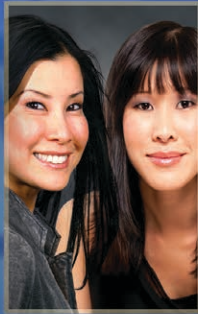
LISA LING LAURA LING