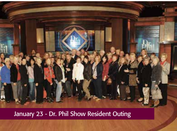
January 23 - Dr. Phil Show Resident Outing

We hope you'll agree that 2013 has been a wonderful year in our remarkable Indian Wells community. Here's a look back at a few memorable and exciting events.