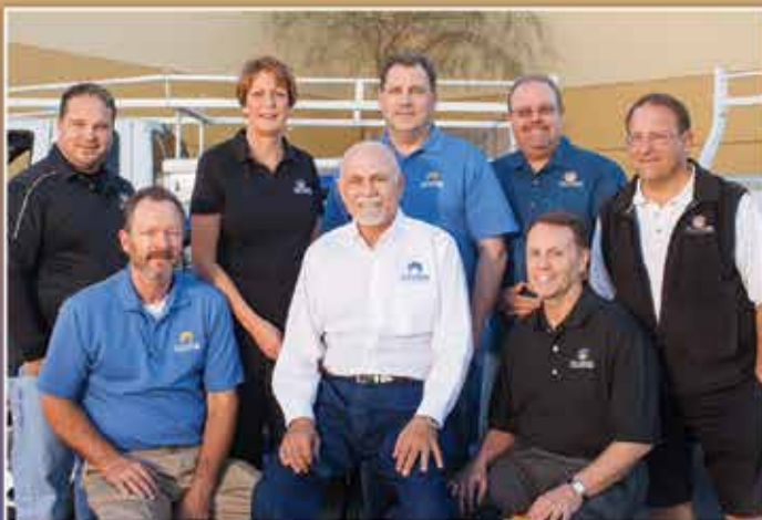
Planet Solar's Team of Solar Sales Professionals