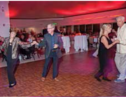
▼ Pavilion Party at the Indian Wells Golf Resort on January 21