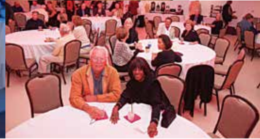
▼ January 24 Galen at the Galen Art Tour – Palm Springs Art Museum in Palm Desert