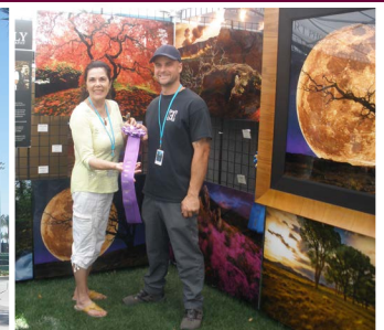
Best of Show photographer Ian Ely