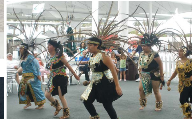
Aztec Dancers, Desert Mirage HS Thermal