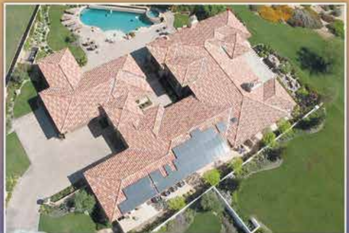
Toscana Country Club Solar Installation