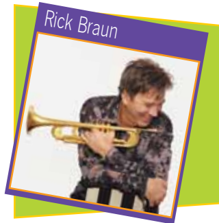
Table seating is limited so purchase your seats and tickets today by visiting www.GroovesOnTheGreen.com . For more information, call (760) 834-3812.

VIP Reserved Table Seating is $85 per person in advance ($90 at the door). VIP table seating includes a VIP reception and wine tasting beginning at 6:30 p.m. Gold Seating advance tickets are $45 per person ($50 at the door) for open theater seating. Doors open for Gold Seating at 7 p.m. The concerts begin at 7:30 p.m.