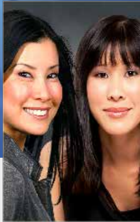
LISA LING & LAURA LING

Former U.S. Secretary of Defense and Director of the CIA, Leon Panetta is one of the nation's most respected bipartisan leaders in recent history. He has devoted his career to the American people, guiding U.S. intelligence, defense and economic strategies over the past four decades.