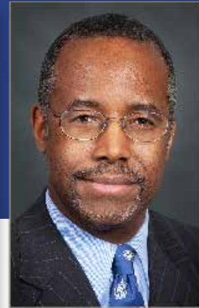
BENJAMIN CARSON, M.D.

Political strategist, former Deputy Chief of Staff and Senior Advisor to President George W. Bush, Karl Rove is an iconic political strategist, whose provocative and robust knowledge of the major political issues of the day have made him one of the most sought-after political pundits of our time.