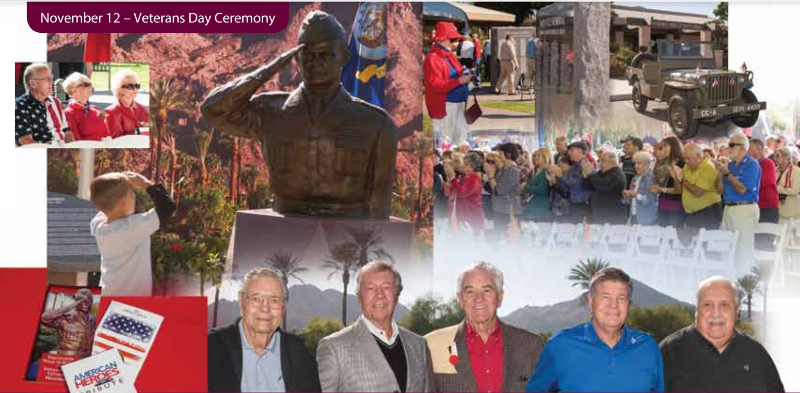
November 12 – Veterans Day Ceremony