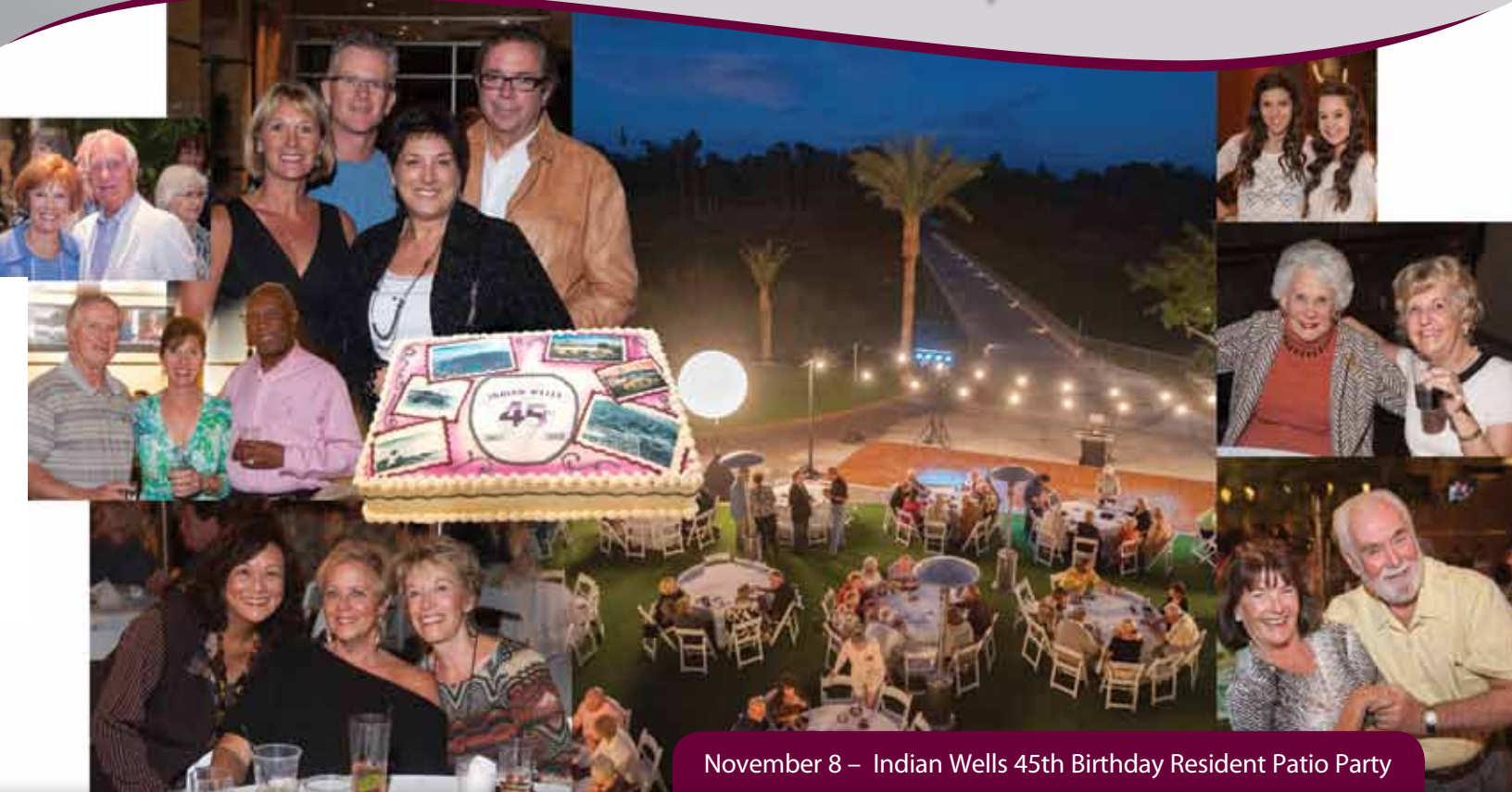
November 8 – Indian Wells 45th Birthday Resident Patio Party