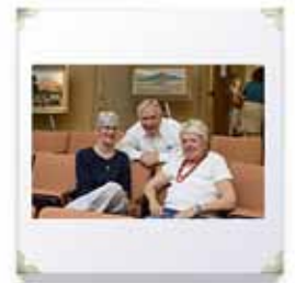
Album City Hall Art Show

Did you know that you can actually send a digital postcard to family and friends from the City of Indian Wells photo gallery? It's as easy as 1-2-3 – all you need to do is log on to www.cityofindianwells.org and click on IW Resident Information. From there, click on Event Photo Gallery on the page left menu. Click on the title of the album of your choice, find your photo and double-click on it. In the lower right you will see an envelope icon with the text "Send to a Friend." Click that text, fill out the information in the box and click SEND, and voila! You have a "picture perfect" postcard!