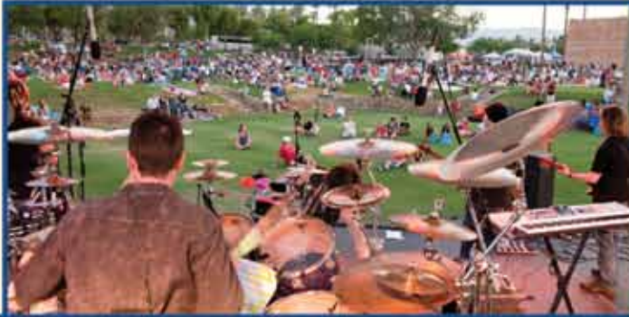
Photo Highlights from Independence Day celebration presented by the City of Indian Wells and Desert Recreation District