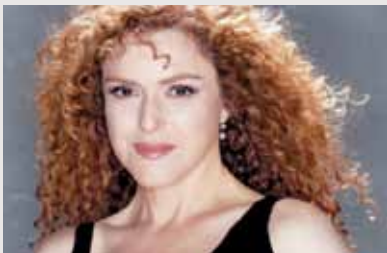
Bernadette Peters (February 11-12)