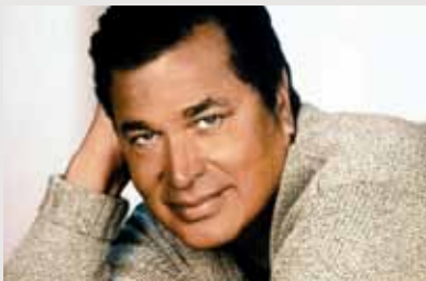
Engelbert Humperdinck (March 4-5)

Tickets are available online at www.mccallumtheatre.com or the McCallum Theatre box office, 1 (760) 340-ARTS.