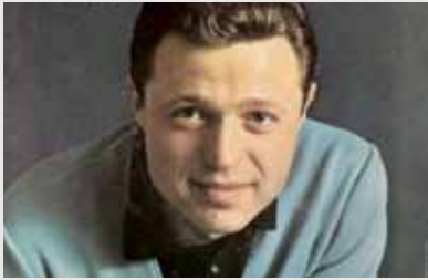
Steve Lawrence (January 28-29)

The City of Indian Wells presents the Living Legends Series at the McCallum Theatre: