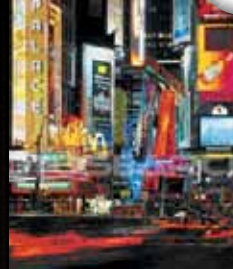
LULLABY OF BROADWAY