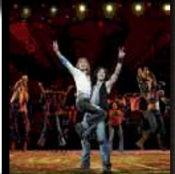
THE SENSATIONAL '60s The Age of Change