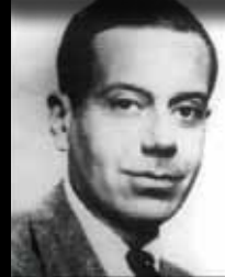
COLE PORTER Night and Day