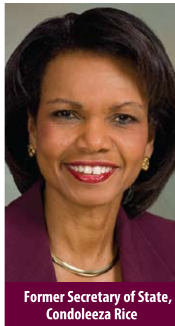
Former Secretary of State, Condoleeza Rice

Desert Town Hall–Indian Wells 2010 season series tickets are now available; the remaining speakers of the 2010 season will be announced in late fall. Reserve your series tickets today by calling (760) 416-3400. For details, ticket prices, and to sign up to receive the latest updates, visit www.deserttownhall.org .