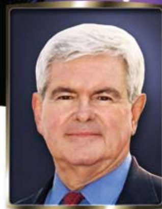
January 26, Tuesday DR. ANDREW WEIL