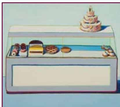
BAKERY CASE, 1996 OIL ON CANVAS, 60 X 72 IN. THIEBAUD FAMILY COLLECTION