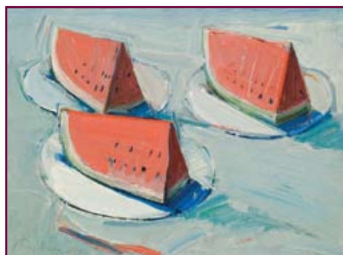
WATERMELON SLICES, 1961 OIL ON CANVAS, 16 X 22 IN. PRIVATE COLLECTION