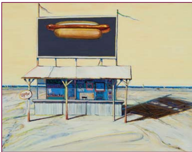
HOT DOG STAND, 2004-2005 OIL ON CANVAS, 48 X 60 IN. COURTESY OF PAUL THIEBAUD GALLERY, SAN FRANCISCO

This exceptional show runs through May 9, 2009. For more information, visit www.psmuseum.org or call (760) 322-4800.