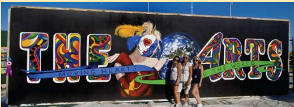
Photo Highlights From The 2009 Indian Wells Arts Festival