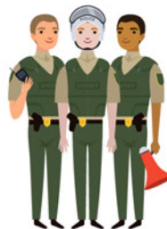
Emergency response SWAT team