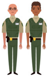
Two full-time Special Enforcement Team officers

Every minute of every day, there are deputies patrolling the Indian Wells community and responding to calls for service. The City's contract with the Riverside County Sheriff's Department keeps residents safe through: