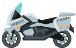
One full-time motor enforcement officer