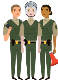
Emergency response SWAT team