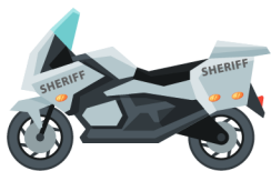
One full-time motor enforcement officer