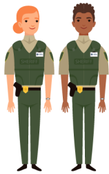
Two full-time Special Enforcement Team officers

Every minute of every day, there are deputies patrolling the Indian Wells community and responding to calls for service. The City's contract with the Riverside County Sheriff's Department keeps residents safe through: